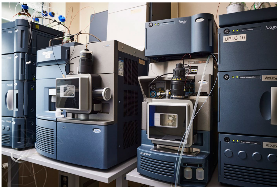
Polpharma API uses Waters UPLCs with tandem mass spectrometry for method development, identification of impurities, and other trace level applications.

Focused on method development and testing, Polpharma API constantly works to stay ahead of ever-evolving regulatory guidelines on contaminants, most recently the detection of nitrosamines in pharmaceutical products. The analytical team is a part of the R&D Department at Polpharma API. They work as an integral part of the 'control strategy' group, in conjunction with other sections and departments in Polpharma API departments. The company has capitalized on the capabilities of advanced analytical instrumentation, particularly liquid chromatography coupled with mass spectrometry (LC-MS) for this purpose.